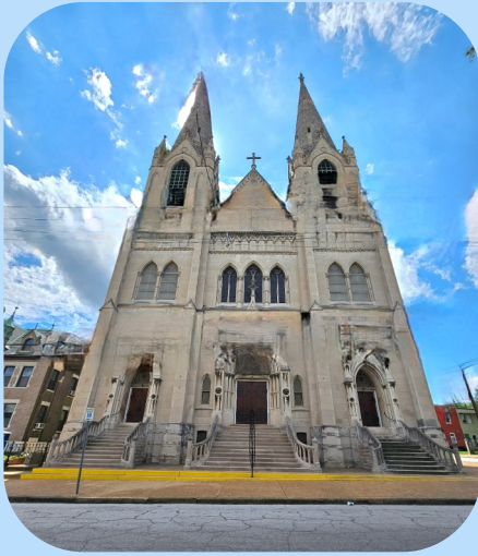
3519 N. 14th St. St. Louis, MO 63107