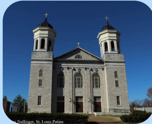
2431 N. Grand Blvd. St. Louis, MO 63106