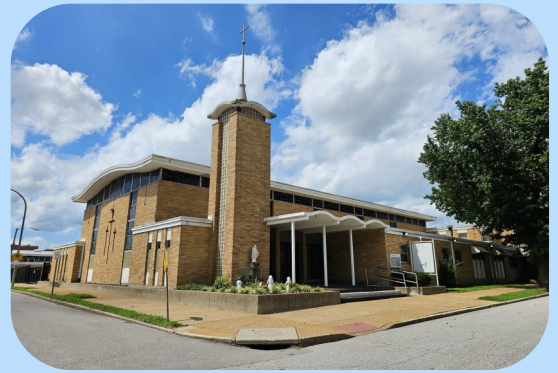
701 N. 18th St. St. Louis, MO 63103