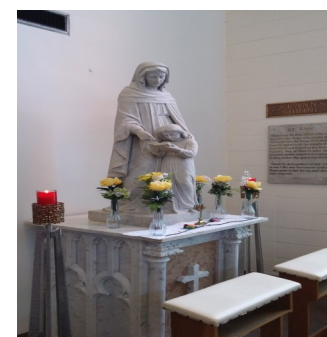
St. Ann, pray for us!