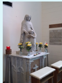
St. Ann, pray for us!

My Jesus, I believe that you are present in the most Blessed Sacrament. I love You above all things and I desire to receive You into my soul. Since I cannot now receive You sacramentally, come at least spiritually into my heart. I embrace You as if You have already come, and unite myself wholly to You. Never permit me to be separated from You. Amen. (Attributed to St. Alphonsus Liguori)