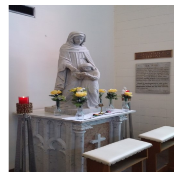
St. Ann, pray for us!