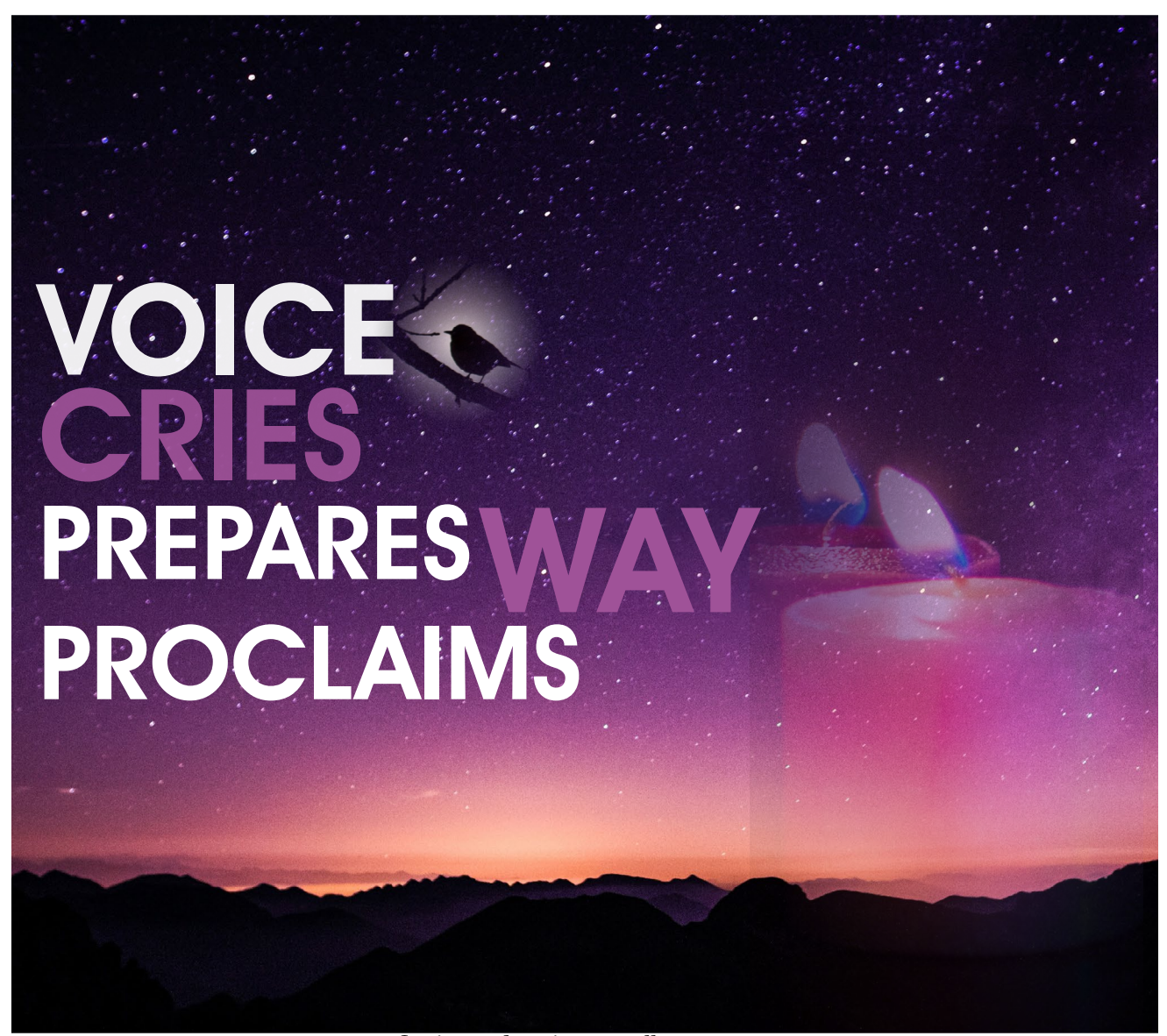
Reflection and Design: Joyelle Proot, SSND