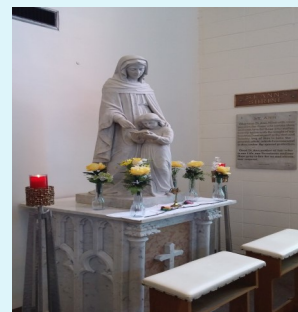
St. Ann, pray for us!

My Jesus, I believe that you are present in the most Blessed Sacrament. I love You above all things and I desire to receive You into my soul. Since I cannot now receive You sacramentally, come at least spiritually into my heart. I embrace You as if You have already come, and unite myself wholly to You. Never permit me to be separated from You. Amen. (Attributed to St. Alphonsus Liguori)