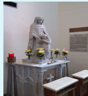
St. Ann, pray for us!

My Jesus, I believe that you are present in the most Blessed Sacrament. I love You above all things and I desire to receive You into my soul. Since I cannot now receive You sacramentally, come at least spiritually into my heart. I embrace You as if You have already come, and unite myself wholly to You. Never permit me to be separated from You. Amen. (Attributed to St. Alphonsus Liguori)