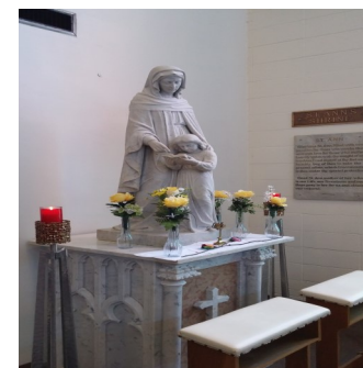
St. Ann, pray for us!